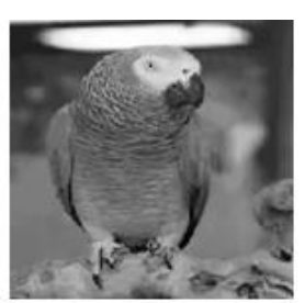
Fig .1 conversion of image to gray scale image

We also test the proposed NCSR deblurring method on real motion blurred images. Since the blur kernel estimation is a non-trivial task, we borrowed the kernel estimation method from [34] to estimate the blur kernel and apply the estimated blur kernel in NCSR to restore the original images. In Fig. 8 we present the deblurring results by the blind deblurringmethod of [34] and the proposed NCSR method. We can seethat the images restored by our approach are much clearer and much more details are recovered. Considering that the estimated kernel will have bias from the true unknown blurring kernel, these experiments validate that NCSR is robust to the kernel estimation errors